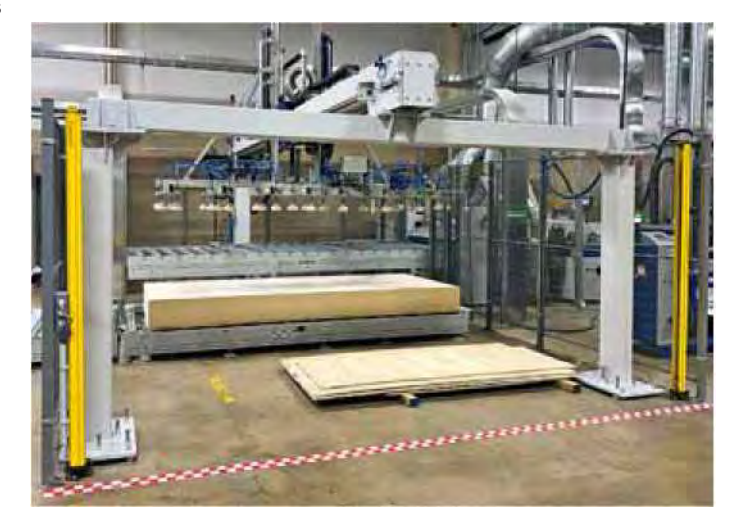
Installed gantry feeder with protection board storage. Positioned in front of a panel cleaning and coating system at a renowned panel finishing company. Version as seen in the CAD drawings (1 to 3)

provided. Collaboration with a globally active major corporation does not always have to be a one-way street. The partners emphasise the coherent Siemens overall package, the flexible and open attitude to software adaptations and the pleasant and cooperative collaboration as a team. These are also good conditions for successfully tackling difficult subjects together in the uncharted territory of the digital world. With the Siemens Cloud ("Mindsphere World" https://mindsphereworld.de), the partner network has a standardized digital ecosystem at its disposal.